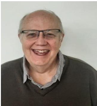
Roger Miller - Julia