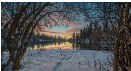
Group by Briggs Lake Chain Association